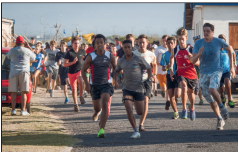
The "Fringe Race"

For the third time running 1stBergvliet Sea Scouts took the rafting winner's trophy and added the 2014 Fringe competition to their long list of victories.