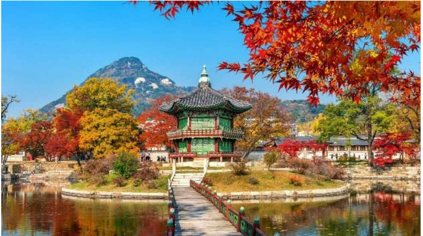
Gyeongbokgung Palace in Seoul